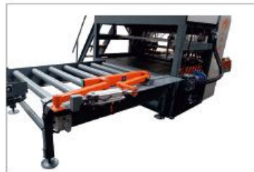
Guide to further processes at line Hat giriş palet ortalama