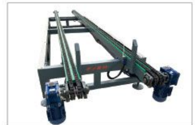
Unloading conveyor 4 - 8 m. length İstif boşaltma 4 - 8 metreye kadar