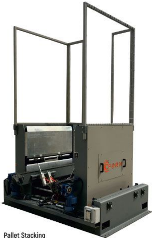
Pallet Stacking Palet İstifleme