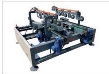
Chamfering unit with 6 blades Tahta pah alma. 6 bıçaklı