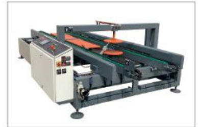
Turner 180° and rotator 90° 90° Döndürme ve 180° Takla atma