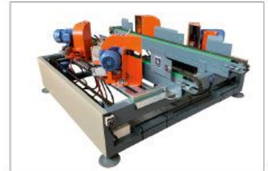
Corner cutting unit with 4 saws Köşe kesme ünitesi 4 testere